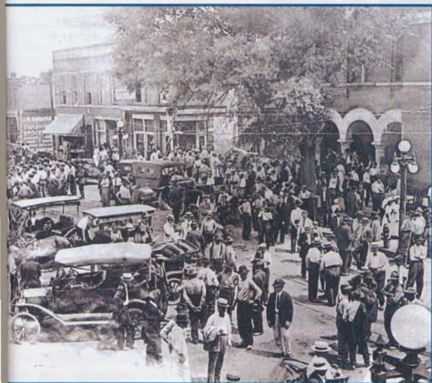
At the town square in Marietta, where Mary Phagan lived, people gathered to celebrate the lynching of Leo Frank.

To learn how this worked, I requisitioned tag records for all cars registered in Marietta from 1913-15. Out of this group of several hundred vehicles were most of those used in the raid on Milledgeville. I also went to school on Marietta society. In the early 20th century, the Journal and the Constitution regularly ran items on dinner parties and social engagements in Marietta—with guest lists that revealed the connections among Marietta's elites. I matched the names of car owners and power brokers with the names of citizens who'd made remarks opposing Gov. Slaton's commutation of Frank's death sentence. Not surprisingly, the same names kept cropping up.