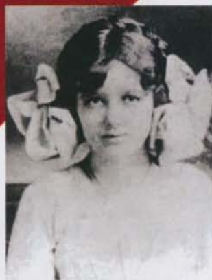
AND THE DEAD SHALL RISE