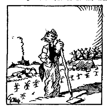
man with the slanting brow who t Victarche is a new kind of cheese

aranging with the car straps It is hardly worth while for a member of the masses to hate the classes for he is likely to be elected alderman at any time in a city which doesn't approve of reform It is very foolish for a member of the classes to get facetious about the masses