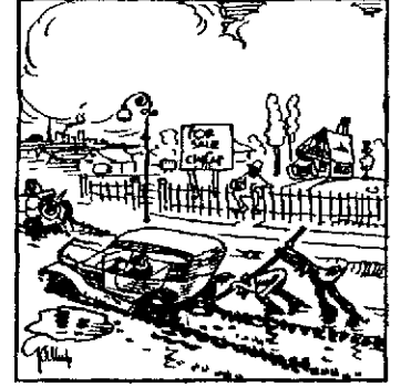
sitil sidestepping him His weariness has grown to be a public wheeze Grief marks him for its own and will not give him ease For all hat passers beg a chance to run him down and defly pull his leg for kopeck yen and crown Is there a scheme on deek to paint the railway tracks? The merchant's shapely neck is first to feel the ax Is there a kindly plan to send the poor some ducks? The weary business man must cough up seven bucks Is there a project big to gild the villuage pump? The business man must dig his favings in a lumn For every cheerful fake, devised by Jack or Jill, the business man must take some roubies from his till The hobges in the jail must have a Christmas tree, oh, merchant, band the kale—he generous and free! A widow needs a pup, to keep the trainings away, oh, merchant, loosen the trainings away, oh, merchant, loosen the trainings away, oh, merchant, loosen he county poorhouse needs, oh, sad-syed business man must fall for every such demand, his back against the wall, his checkbook in his back is a contraction.

and of spanes windrases and rubber hoots and will not love their native land so much when they get through while a few adventurers will rim their cars into the red clay of the wouth and after they have been extracted by a derrick will go back home to increase the sectional feeling. There are now many thousands of miles of very good road in the United States. There are also hundreds of thousands of miles of road which is no better in wet weather than a river bottom. Those cities which are reached by good roads will notice vast swarms of tourists on their streets this summer dropping ten dollar bills vith the careless shandom of the automobile owner while those towns which have fortified themselves against the world by maintaining much high-