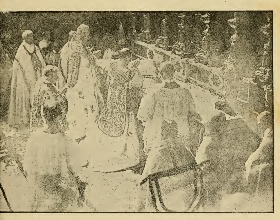
THE POPE HAS PHOTOGRAPHS TAKEN, AS HE MAKES GOD OUT OF A PAN-CAKE.

The instruments of torture which were used to inflict the pains of hell upon the Protestants, are