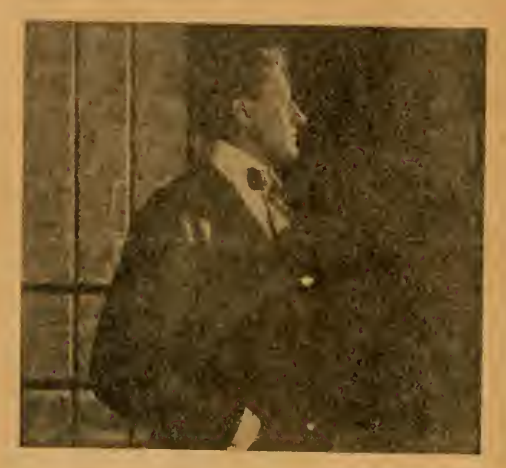
LEO FRANK, IDEALIZED IN THE HEARST-SELIG MOVING PICTURES.

close to the man whose active brain dictated those notes.