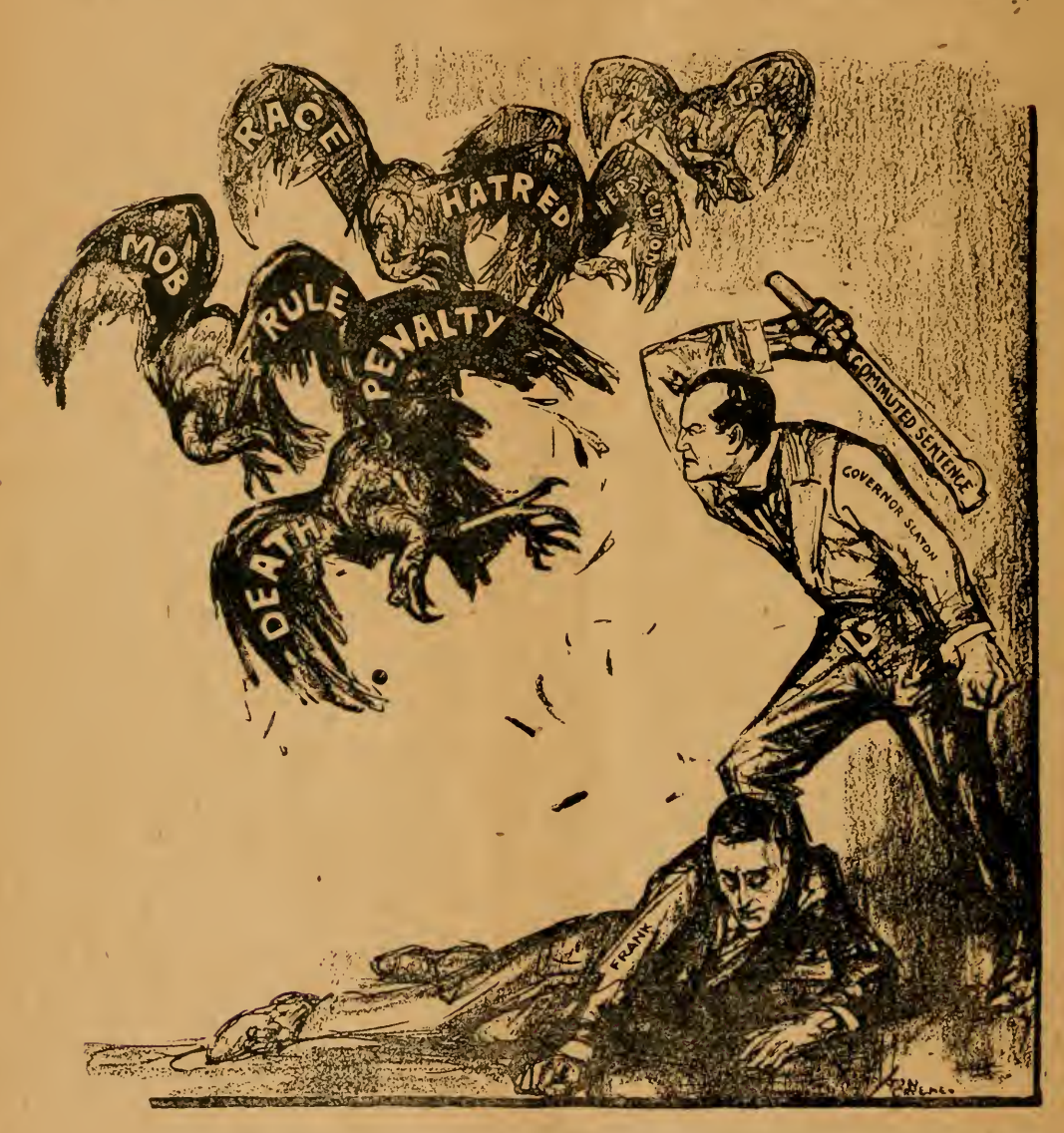
GOVERNOR SLATON BEATING OFF THE VULTURES.

Blackstone expressly says that it would be against all correct principles, to allow the power of judging and of