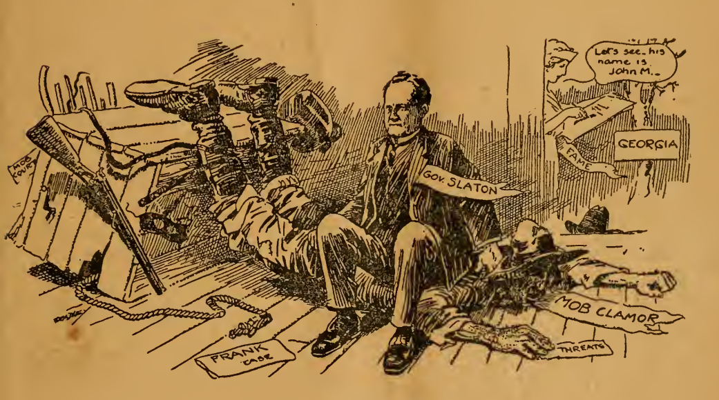
JEW CARTOON-SLATON SUPPRESSING "MOB LAW."

But Slaton felt no pity; he devoted no anxious days and nights to the study of that case: he made no mysterious visits to New York while that case was pending: and he had nothing to say against circumstantial evidence, then.