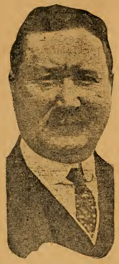
THE NOBLE BURNS.

Even the sapient Burns realized to the full the enormous weight of those six or eight strands of woman's hair,